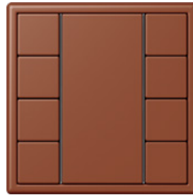
F 50 sensor, 4-gang