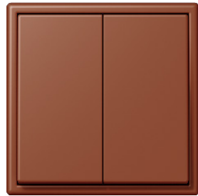
F 40 sensor, 4-gang