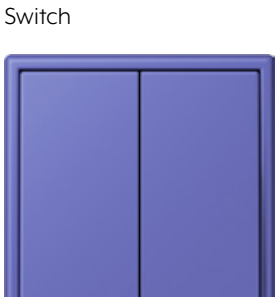
F 40 sensor, 4-gang