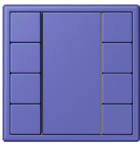
F 50 sensor, 4-gang